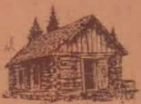
OLD LOG SCHOOL

Our son heard you speak a couple of years ago when he was a student at Hillsdale and said "you were the man."