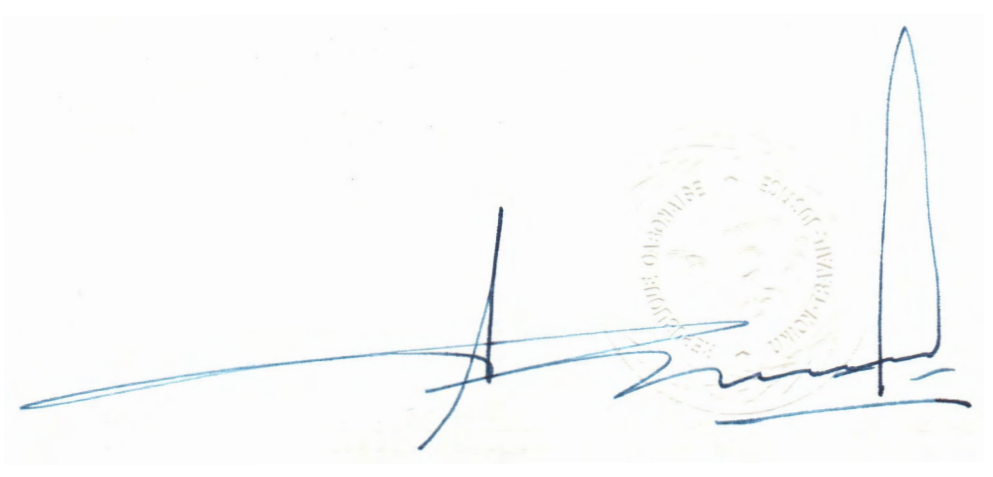
El Hadj Omar BONGO

En espérant que celle-ci se concrétisera par un plein succès et par des résultats positifs, je vous remercie à l'avance, Monsieur le Président et Cher Ami, de toute la bienveillante attention que vous avez bien voulu accorder à la présente correspondance, et je vous prie de croire à l'expression de mon fidèle souvenir et de ma très haute et fraternelle considération