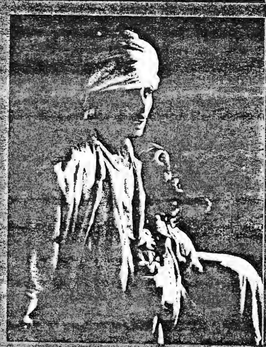
Managing Regional Armed Conflict