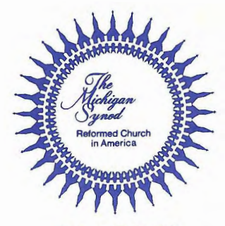
God's people joined in fellowship and mission

The President The White House Washington, D.C. 20500