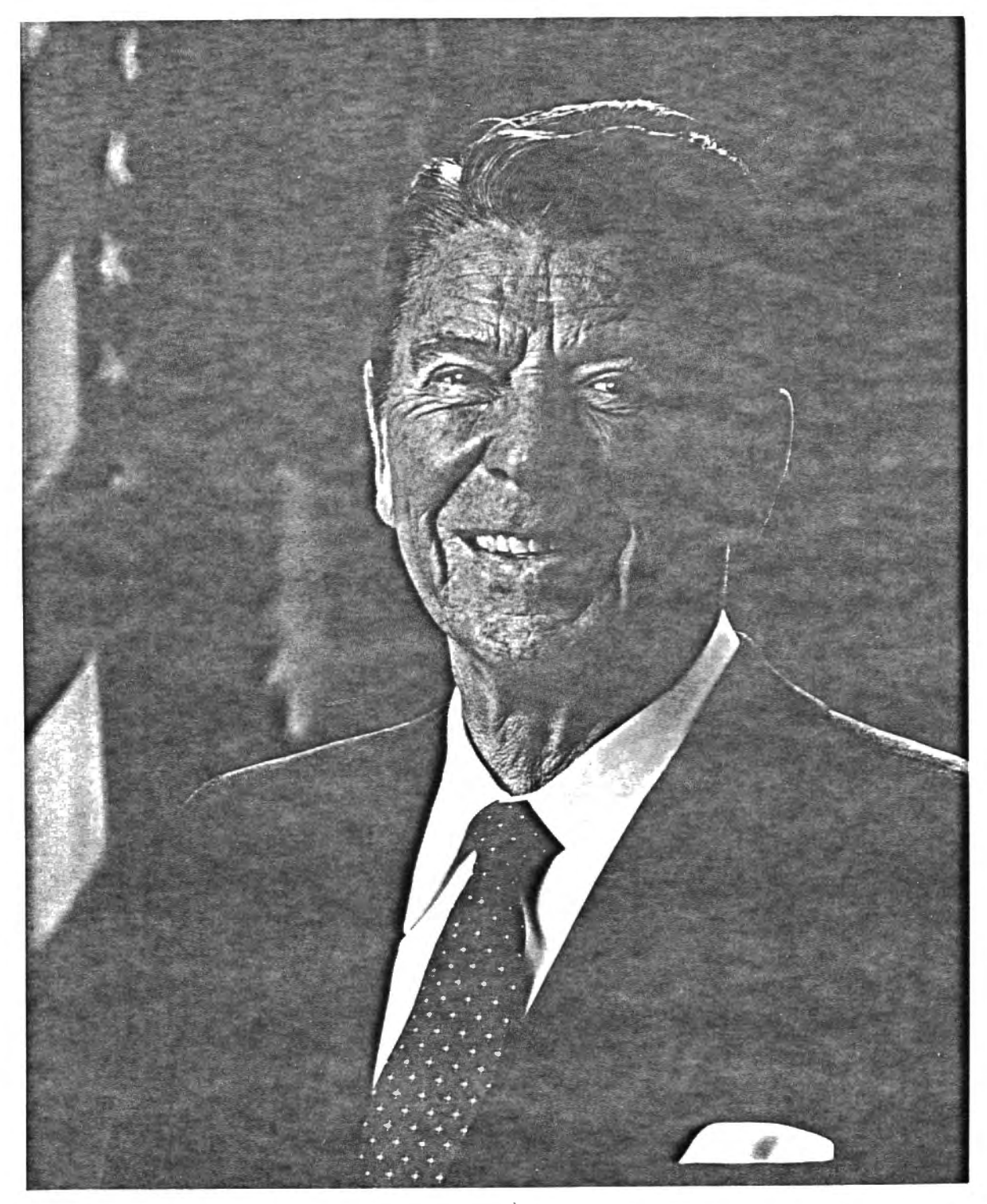
To Brett a. Beach - With great appreciation, oborage View bonds great regards of Rosel Bagon