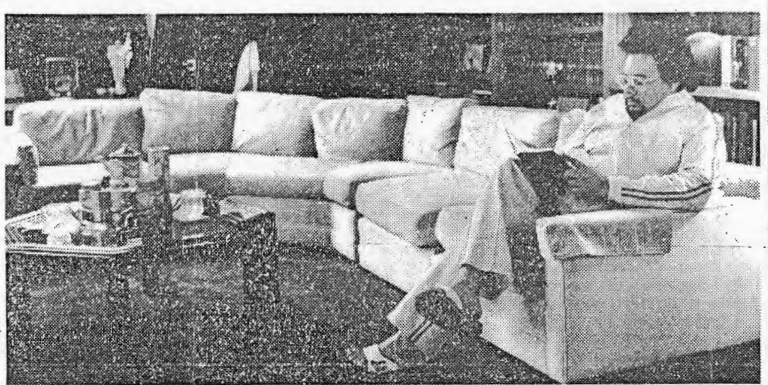
King . . . in a rare tranquil moment at home.

In anticipation of a spring opening, construction is continuing on Mr. King's, a ParkFair restaurant