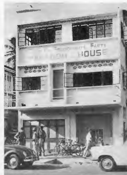
Cheddi Jagan's Headquarters