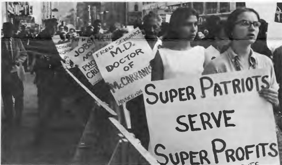
Pickets and their banners organized by the Communists.

In view of the extraordinary circumstances that confronted us this attendance was a triumph. Prior to this rally the Democratic Party had sponsored a birthday celebration for Mrs. Eleanor Roosevelt. Many film stars were featured. The attendance was 2,500. We are proud 8,000 attended our rally.