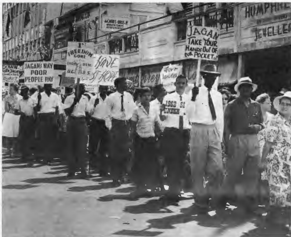
Street demonstrators protest Jagan's Regime prior to February riots and arrival of British troops.