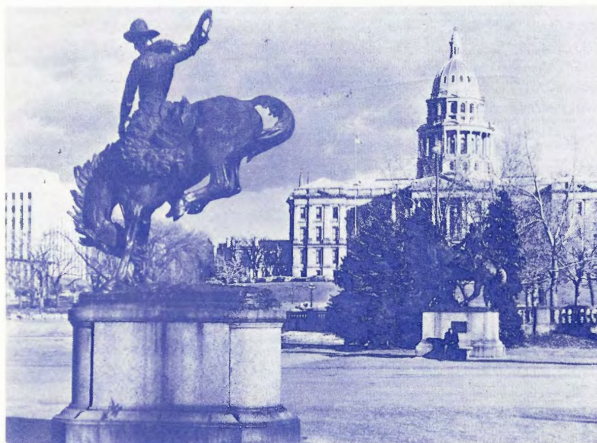
The "Bucking Bronco" and Colorado Capitol in the Mile High City

Sponsored by Center for the Study of the Presidency