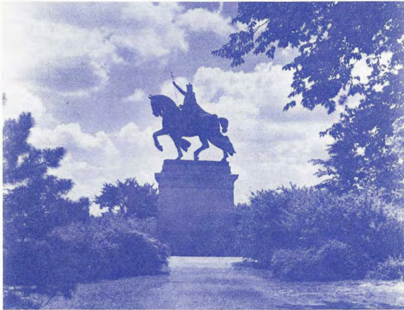
Saint Louis (Louis IX of France), Forest Park St. Louis, Missouri