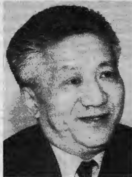
Bishop Ding Guangxun

Bishop Ding's arrival was the latest in a series of moves by Chinese authorities to extend the hand of recognition to China's Christians and other religious believers. In January the Religious Affairs Bureau, dormant for years, was revived in Peking, along with units in