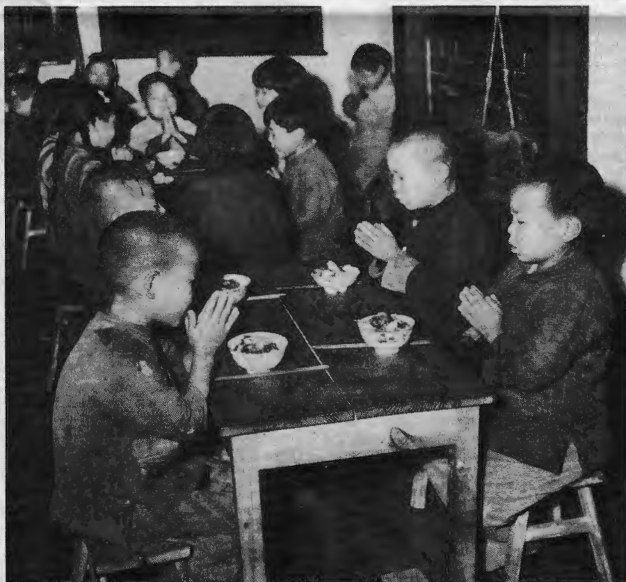
In happier days kindergarten children say grace at Hangzhou mission in 1946