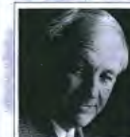
John R.W. Stott Director, London Institute for Contemporary Christianity Bible Study Leader