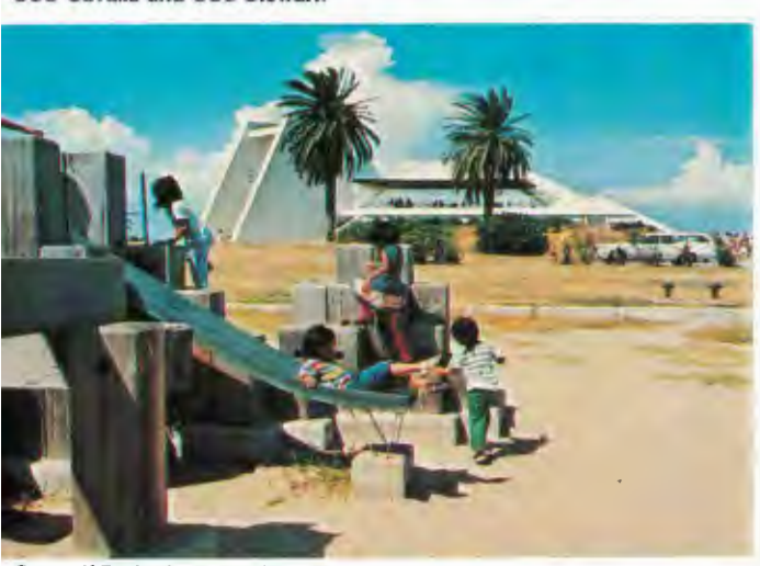
Seawolf Park playgrounds and pavilion.

Giant cargo ships from around the globe.