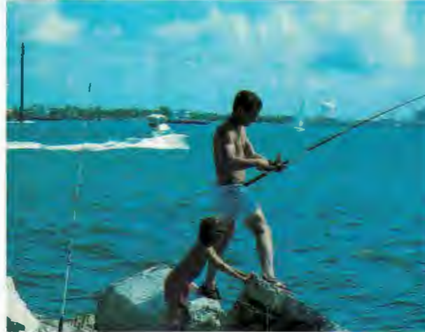
Seawolf Park is one of Galveston Island's most popular fishing spots. Flounder and trout are favorite catches and park guests may wade fish, fish from the bank or from a 380' pier.