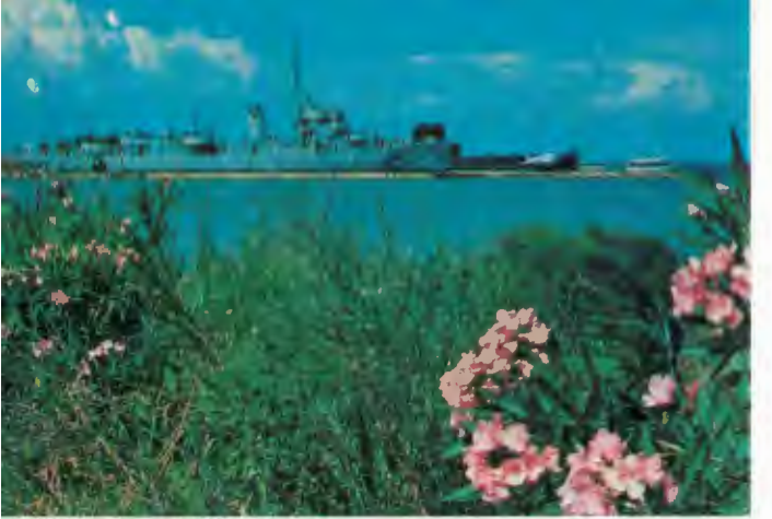
USS Cavalla and USS Stewart