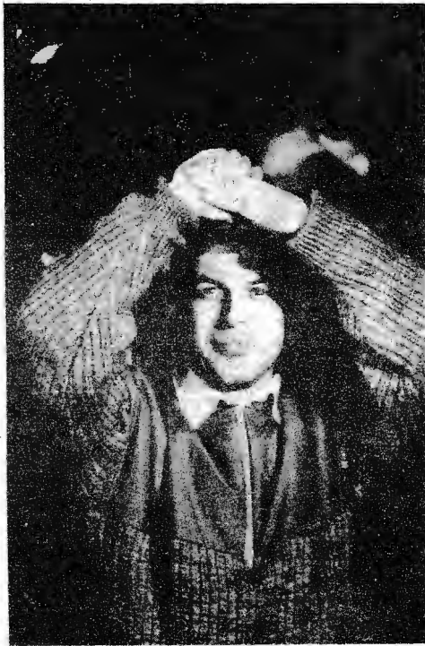
Anatoly (Natan) Sharansky is a free man, but human rights for the Jews he left behind in the Soviet Union must be vigorously pursued. "Sharansky: The Struggle Continues" is a 12-minute videotape showing the ongoing struggle that Sharansky represents. It was produced by and is available from National United Jewish Appeal, 99 Park Avenue, New York 10016.