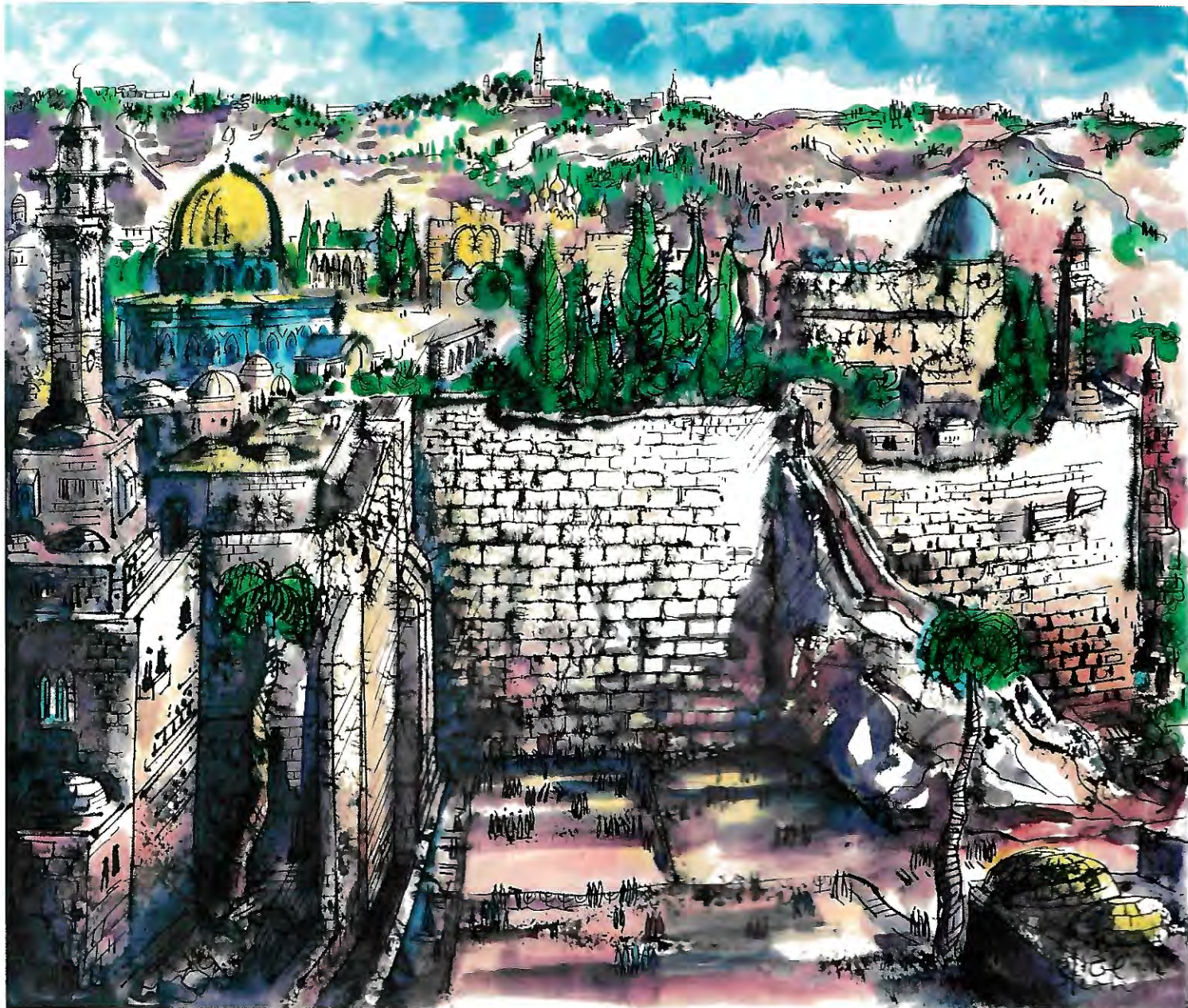
The Western Wall