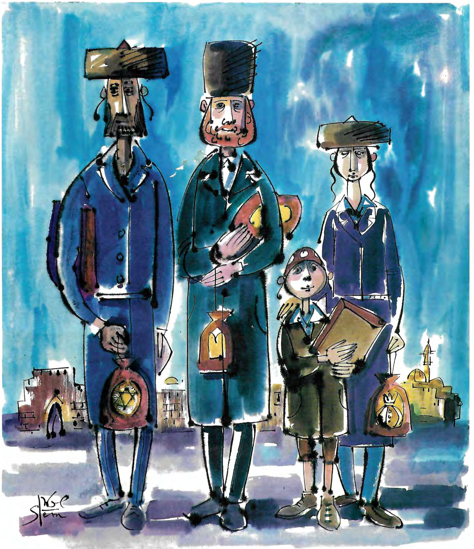
Back from the Western Wall

O Israel, you are mine, my chosen ones; to you are Abraham's family, and he was my friend.