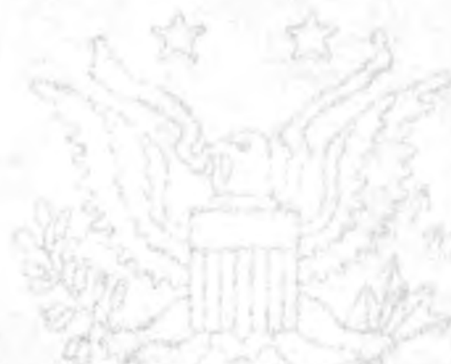
L. Paul Bremer, III Executive Secretary

We continue to believe that the President of Iceland, the only Ally whose Head of State has never been received in this country, be welcomed for an official working visit. Other visiting Nordic Heads of State, or their representatives, might then be included at a function as invited guests, as appropriate.