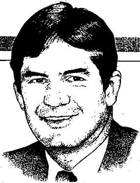
DRAWING BY MARGARET KING

■ Fourth, it is one thing to accept the total vulnerability of one's society, if there is no practical choice; it is quite another to choose to perpetuate that condition, as the inexorable consequence of failing to support a research effort to see if strategic defenses that could provide a useful level of protection are achievable. The Strategic Defense Initiative (SDI) is a moral imperative; the prospects for affordable technical success seem to be high enough that no responsible administration should do other than pay the formidable research and development entry price so the policy debate can pro-